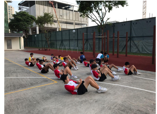
Physical Training & Platoon bonding games