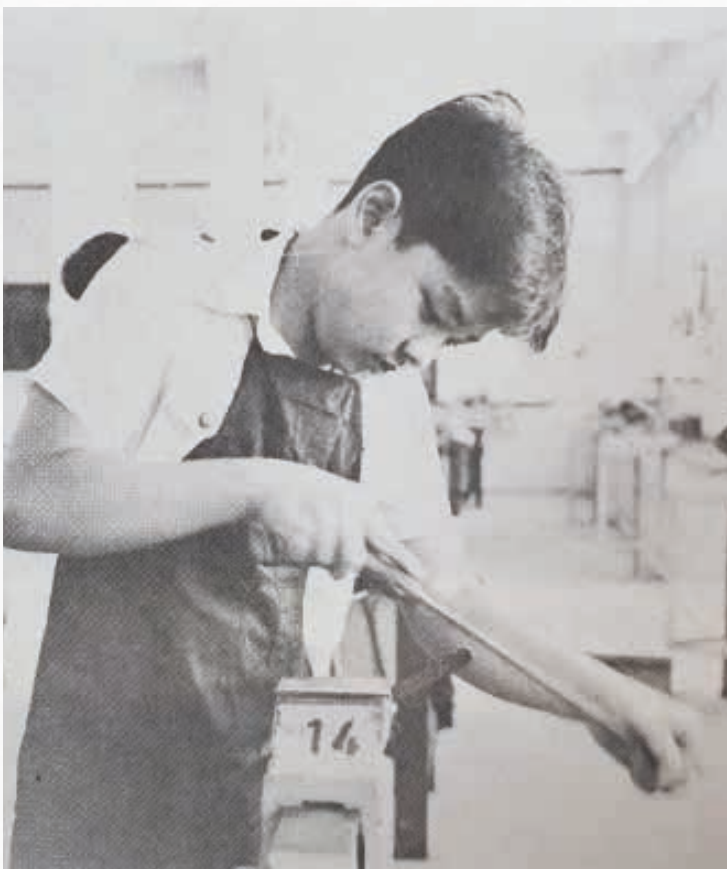
A student working in the technical workshop in the 1980s