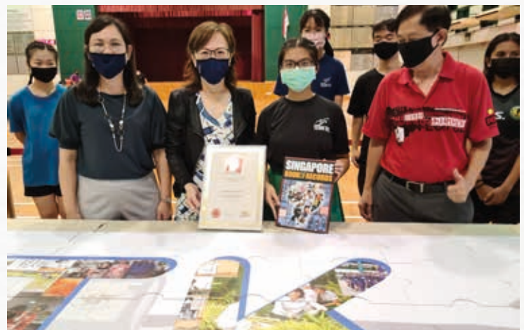
Pictures (from top left, clockwise): Sec 4 students playing Jenga; Racking their brains to solve the clues; the student organisers in front of the completed puzzle; Earning a place in the Singapore Book of Records; Piecing the puzzle together