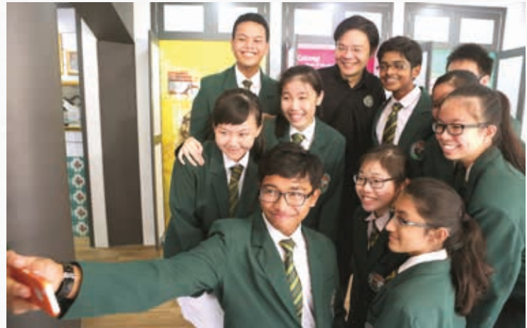
Mr Wong taking a wefe with TKsians at our Heritage Centre in 2014

As Minister for Education (2020–2021) , Mr Wong implemented initiatives to instil digital and inter-disciplinary learning, and helped to set up a new University of Arts.