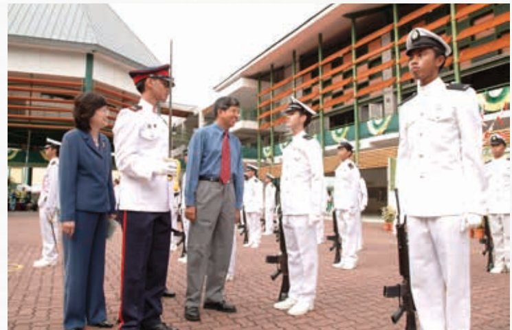
Dr Yaacob inspecting the parade contingent during Speech Day in 2004

Prime Minister Lee Hsien Loong at an appreciation dinner for ministers stepping down from the Cabinet in 2018