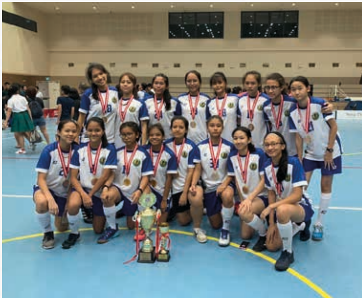
TK 'C' Division Floorball girls clinching the national champion for their fourth consecutive time!

That year, we brought back the Gold with Honours award.