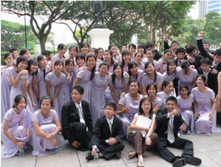
The TK Choir outside the Victoria Concert Hall during their SYF